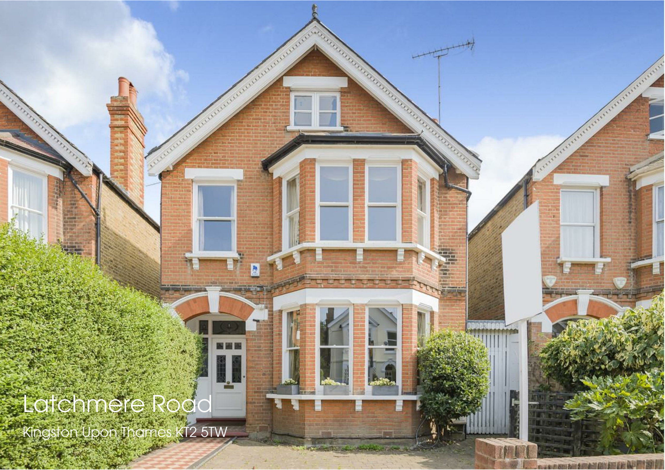
Latchmere Road Kingston Upon Thames KT2 5TW